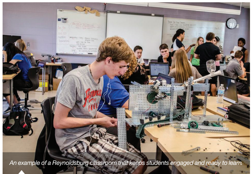
An example of a Reynoldsburg classroom that keeps students engaged and ready to learn.

Deeper Learning teaches students to master core academic content, think critically, solve complex problems, work collaboratively, communicate effectively, direct their own learning, and develop an academic mindset.