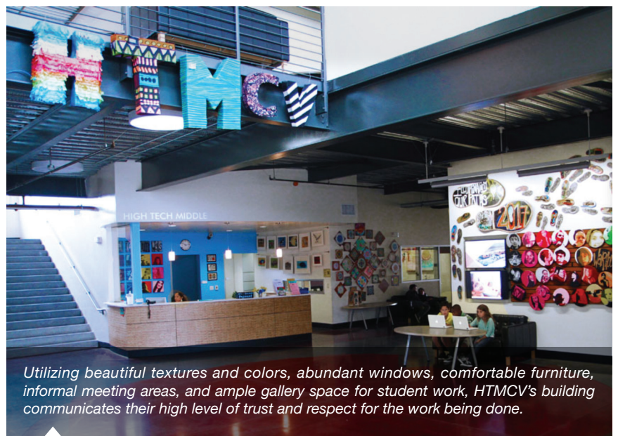
Utilizing beautiful textures and colors, abundant windows, comfortable furniture, informal meeting areas, and ample gallery space for student work, HTMCV's building communicates their high level of trust and respect for the work being done.

With those goals in mind, students participate in Project-Based Learning experiences that engage them in the Deeper Learning activities by solving complex, open-ended problems. Morton noted that students often have the opportunity to work with local business professionals and other community members as they develop their critical thinking, critique, and presentation skills. In the process, they create beautiful, relevant work to share in the “real world.”